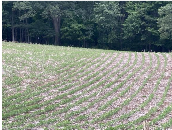
NO TILL SOYBEANS